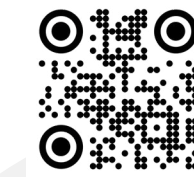
D3 - 20/.06 22mm

For premium performance without the high price, go with FlowLogic™.